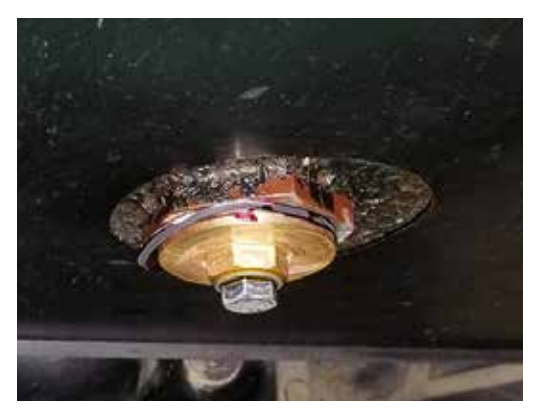
Gas drain plug.