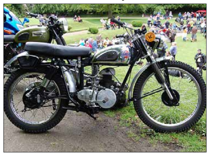
Biking to Berlin during the Cold War.

INSIDE THIS ISSUE: President's Report Youthful Adventures in Motoring Editor's Laptop Tech Tip