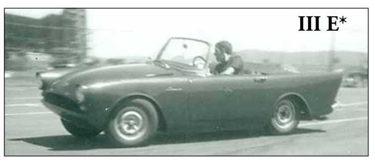
*Automatically disqualified because these are only pretending to be Jaguars.