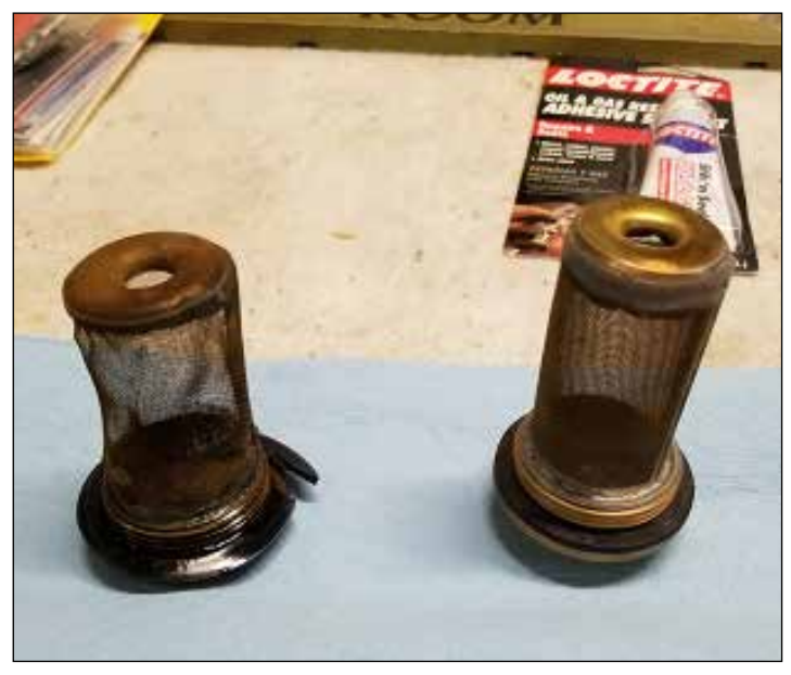
The old (left) and new drain plugs with attached mesh filters.

remaining gas into that Giant Green Drain Pan™, it almost overflowed! So, looking at the gas gauge, it wasn't quite down on empty – and the low fuel light hadn't even come on yet. I thought a quick drive would burn off more gas and make draining the rest a bit less uncomfortable.