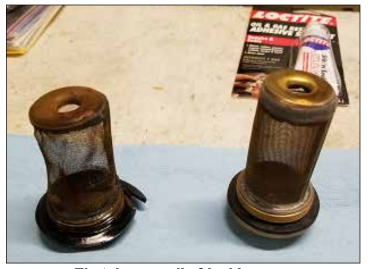
That darn smell of leaking gas.

INSIDE THIS ISSUE: President's Report Youthful Adventures in Motoring Editor's Laptop Tech Tip