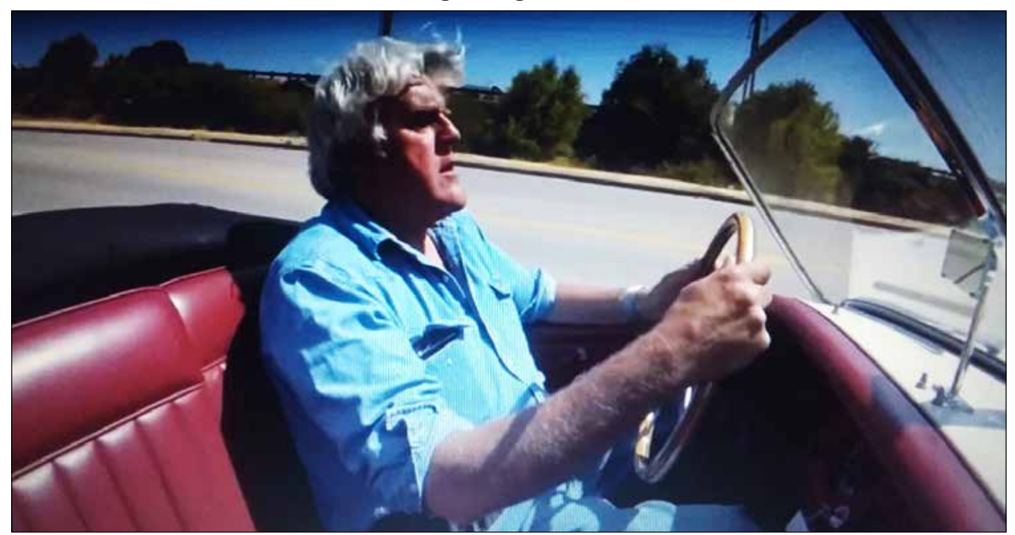
Jay Leno expounds on the joys of owning the Jaguar XK-120 he bought in 1982 while cruising down a road in Southern California.