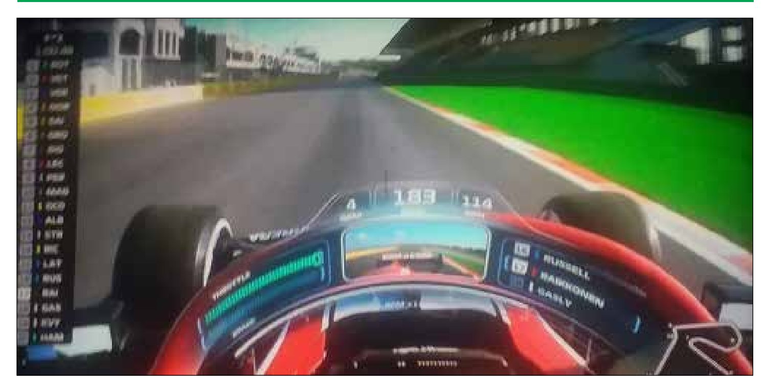
In-car cameras, digital tricks, etc., enhance the at-home viewing experience of major motorsports events.