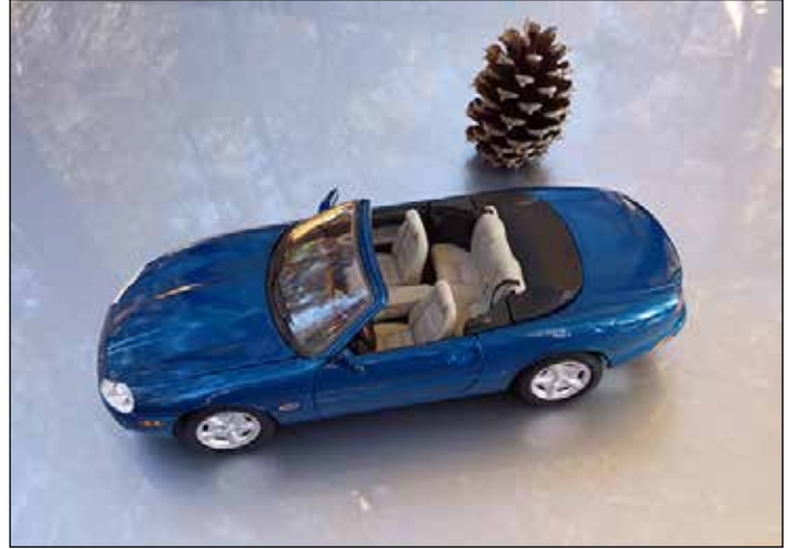
Our distinguished panel of judges will select winners in each category from these finalists. Winners will be announced in March.