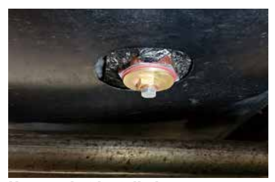
New gasket installed.

Again, some thread sealer, a thin coating of High-Tack, and put it back into the tank. With so much going on, I still haven't even gotten gas back in the tank to test it, so the jury's still out on that. Hopefully, a "Part III" of this saga will be in next month's newsletter – with news of my success!