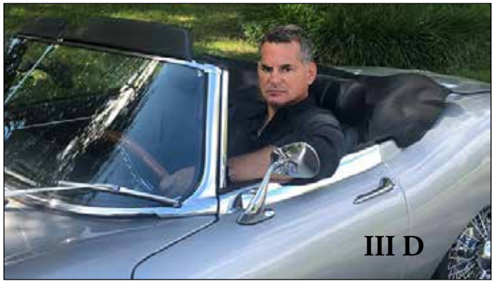
See Concours, p. 11