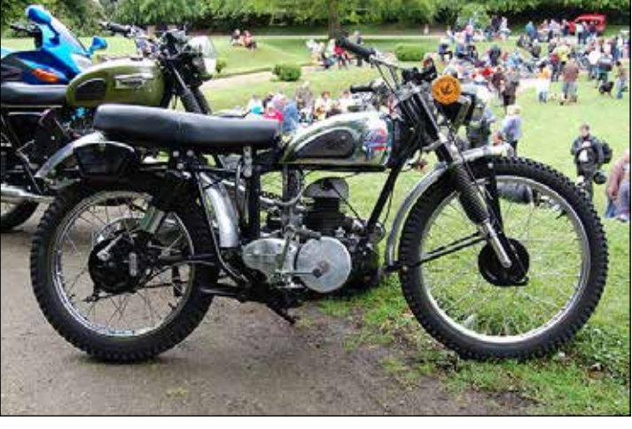
A Vintage Villiers-engined Dot motorcycle.

on the way to the ferry at Dover. The kickstarter on the Villiers turns over the engine via the clutch, so the DOT would neither start nor drive. I was very fortunate that a RAC motorbike patrolman stopped and replaced the cork lined clutch plate for free after hearing my destination. I was now beginning to doubt the DOT claim.