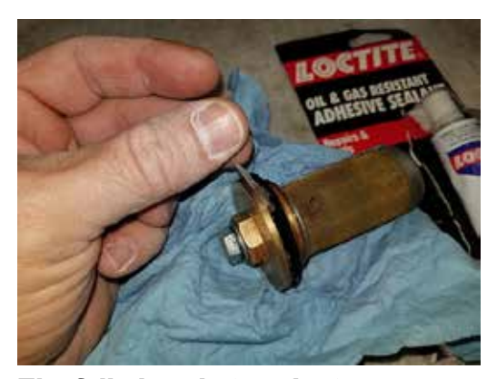
The failed gasket sealant.