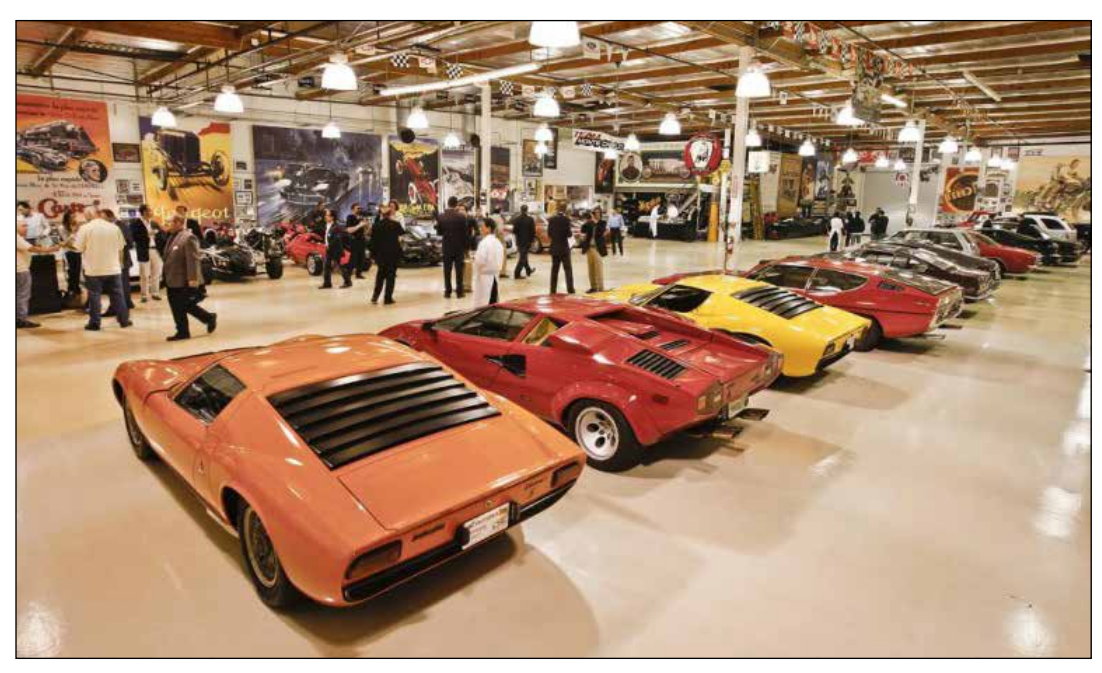
Leno's garage houses more than a few Italian, German, American and even French and Japanese classics as well as British cars.

(Editor's note: If you haven't viewed the Jaguar related episodes of Jay Leno's Garage on YouTube, this winter of Covid-19 provides a splendid opportunity.)